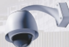
G3 ENVIRODOME & DAY/NIGHT WALL MOUNT