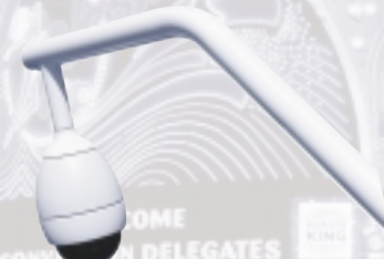
G3 PARAPET MOUNT